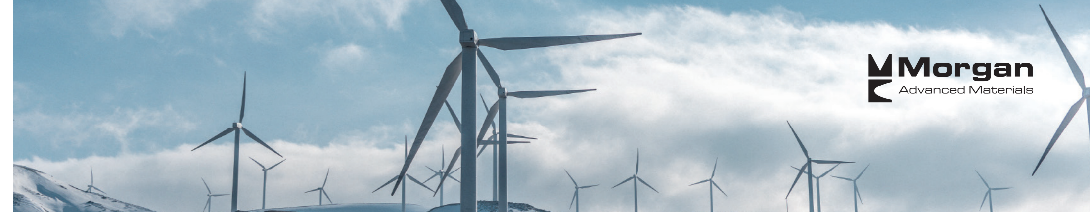
Nominal Values of Carbon Brushes for Wind Turbine Applications